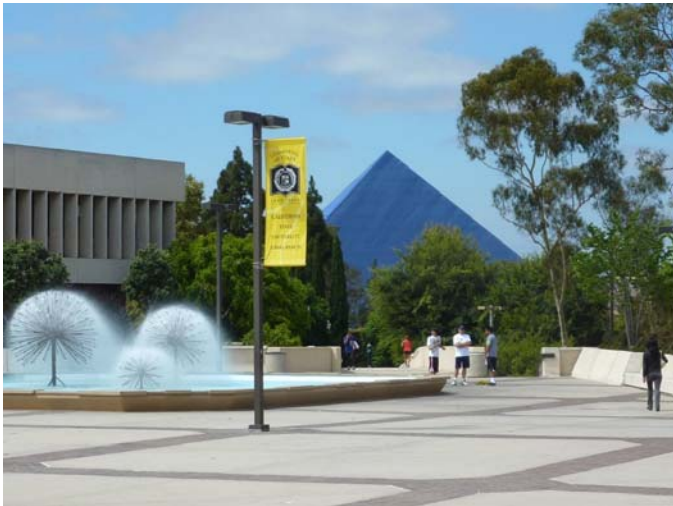
CSU Long Beach Pyramid Sports Arena

California State University Long Beach, CA